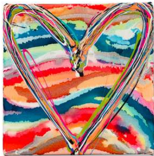
Modern Love #8

Acrylic, pastel, ink & resin on custom canvas