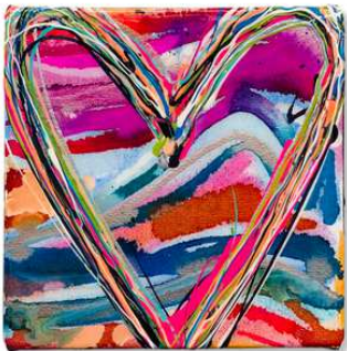
Modern Love #1